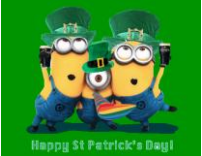
Happy St Patrick's Day!

16 PIZZA SLICE Seasoned Green Peas Applesauce